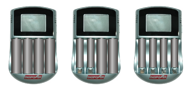
Fig.1 Charging 4pcs of AA or AAA

3.If charging only 2 batteries at a time, place the batteries in the left or right side compartments of the charger.(Fig.2)